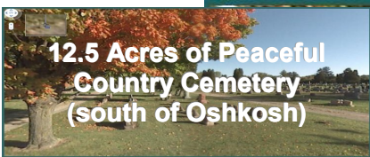
12.5 Acres of Peaceful Country Cemetery (south of Oshkosh)

A place where lives are commemorated, memories are made tangible, and tributes are paid to the life, not the death of loved ones.