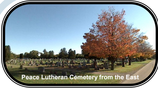
Peace Lutheran Cemetery from the East

Looking back, how many times have you wished you had taken care of things when they would have been easier? The loss of a loved one is one of the greatest challenges a person/family may experience. The emotional strain of planning a funeral is stressful, emotional and exhausting.